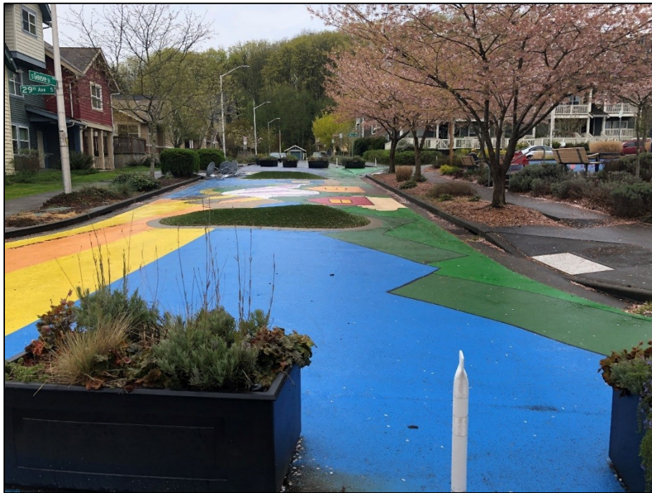
Figure 2: Street View of Rainier Vista Pavement to Parks